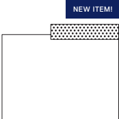
#75 - R BUMPER 60"W x 38"D