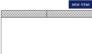
#53 - ARMLESS 81"W x 38"D