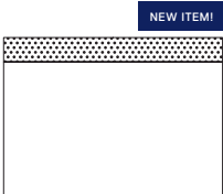
#82 - ARMLESS 54"W x 38"D